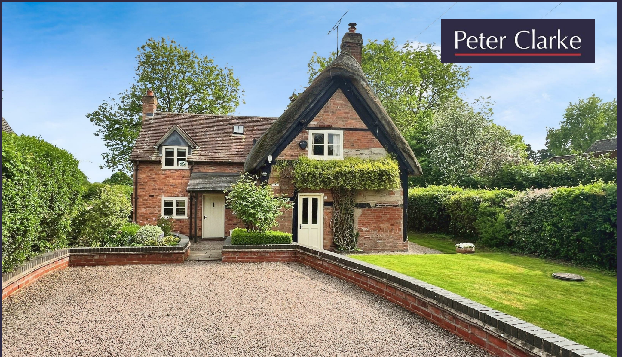
Toad Cottage, 4 Church Lane, Barford, CV35 8ES